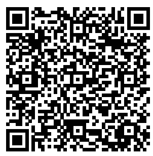
Find us on Google Map